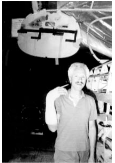
I still have some $10,100 in Falco kits to buy, plus an engine and avionics. Such an expenditure for the pieces alone of a two-seat wooden airplane of doubtful resale value cannot be rationalized.

One U.S. builder doesn't agree and is currently asking $150,000 for his admittedly outstanding, superfast, Ferrari-red kit-built Falco and has even consigned it to a dealer for resale, but I think the man is daft, joking or trying to start a Falco tulipmania. True, there has never been anything like the Sequoia Falco on the used-plane market, but nearly new Christen Eagles, another excellent kit-built design, generally sell for the value of the kit components at best. And a builder's liability when reselling a homemade airplane can best be protected, lawyers tell me, by neither making nor even implying the tiniest claim touting the airplane's condition, worthiness, performance, safety or suitability as anything other than a sump for the buyer's money. I doubt that a 160-hp airplane can be sold for the price of a nice house as is, where is, take it or leave it.