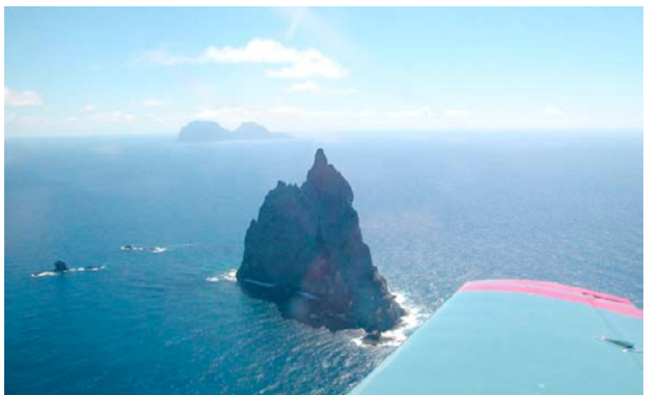
Top: Before departure. Center: The packed aircraft. Above: Ball's pyramid and Lord Howe.