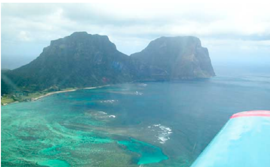
Top: Lord Howe, Ball's pyramid and Admiralty Islands. Center: With luggage at Lord Howe. Above: Mts. Lidgbird and Gower.

not high, but are very rugged. I would prefer to land in the water any time. It was many years after settlement before explorers were able to cross them to the inland plains. Soon we were landing at Taree and preparing for a reasonably early start in the morning.