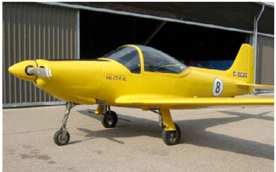
Top four photos: Larry Black’s fairings gave him a sizeable speed increase.

just go to the next largest wire size and use the appropriate circuit breaker to match the wire. Remember, the purpose of the circuit breaker is to prevent a fire in the event the wire over-